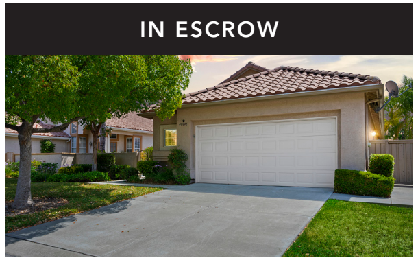
40646 VIA JALAPA, MURRIETA 2 BD | 2 BTH | 1,607 SQ FT LISTING PRICE: $499,900

An entertainers dream home! Double door entry. French doors in bedroom, 2 full custom bathrooms. Cool, classy 18-inch travertine tile with custom inlays. Cook's kitchen, granite countertops, stainless steel appliances. 3 car garage w/epoxy floors. Designer backyard. BBQ island, Alumawood patio cover, new vinyl fencing. 20 paid for solar panels and 2 Tesla power walls in garage!!