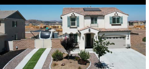
31657 ROUGE LN, MENIFEE 5 BED / 2.75 BATH / 2,402 SQ.FT LISTING PRICE: $680,000 CLOSED AT: $680,000

Beautiful two-story pool home in the "Mosaic" neighborhood, Menifee. Built in 2018, this spacious 2,402 sq ft home features 5 bedrooms, 2.75 baths, and RV/boat parking. Highlights include vinyl plank flooring downstairs, upstairs loft, central heat/air, ceiling fans, leased solar, and a tankless water heater. The kitchen boasts granite countertops, a tile backsplash, and stainless -steel appliances. Entertainer's backyard with patio cover and Astroturf. Community park and sports court. Close to schools, shopping, and freeway.