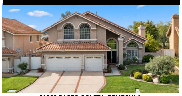
31628 PASEO GOLETA, TEMECULA 5 BED / 3 BATH / 3,087 SQ. FT LISTING PRICE: $865,000

Gorgeous two-story home in the "Rancho Vista Estates" Community, Temecula. Featuring 3,087 sq. ft., 5 bedrooms, and 3 baths (1 bed/bath downstairs). Enjoy sunset views from the primary bedroom balcony with 2 walk-in closets and a luxurious bathroom. Highlights include hardwood and tile flooring, ceiling fans, 2 fireplaces, crown molding, recessed lighting, a wet bar, a custom kitchen, indoor laundry, and a 3-car garage. Large backyard with pergola, stream, and waterfall. Close to parks, schools, shopping, and wineries.