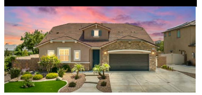
26345 ADELINA DR, MENIFEE 4 BED / 3 BATH / 2,481 SQ. FT LISTING PRICE: $719,900

CLOSED AT: $750,000 SOLD FOR: $30,100 OVER ASKING