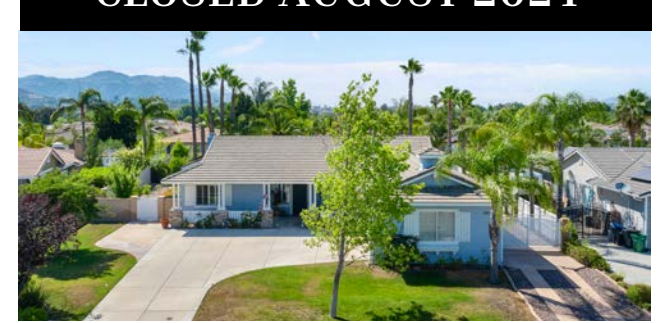
42332 CHISOLM TRL, MURRIETA 5 BED / 1+.75 +.50 BATH / 3,084 SQ. FT LISTING PRICE: $1,299,000 CLOSED: $1,297,000

Welcome to your dream home in the highly sought-after Murrieta Ranchos Community! Sprawling across 3,084 sq. ft. of luxurious living space on a 0.38- acre lot. This home offers an abundance of flat, usable land with RV access. Enjoy the serene and private backyard paradise featuring a gorgeous grotto pool with a waterfall, a built-in fire pit, a gazebo, and a covered patio with recessed lighting. Step inside to discover elegant 10-foot coffered ceilings, crown molding, and custom blinds and shutters