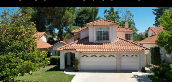
32106 VIA SALTIO, TEMECULA 4 BED / 2.75 BATH / 2,693 SQ. FT LISTING PRICE: $759,900

CLOSED AT: $764,900 SOLD FOR: $5,000 OVER ASKING