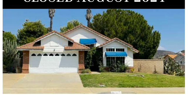
33742 VIEW CREST DR, WILDOMAR 3 BED / 2 BATH / 1,272 SQ. FT LISTING PRICE: $525,000

CLOSED AT: $530,000 SOLD FOR: $5,000 OVER ASKING