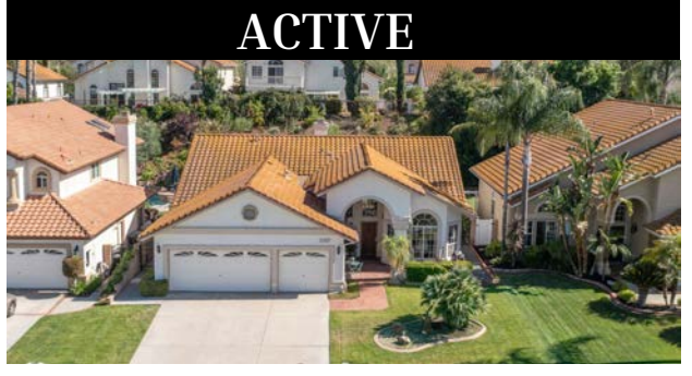
31367 CORTE MONTIEL, TEMECULA 4 BED / 2 BATH / 2,160 SQ. FT LISTING PRICE: $765,000

Welcome to your dream home in the highly sought-after Murrieta Ranchos Community! Sprawling across 3,084 sq. ft. of luxurious living space on a 0.38- acre lot. This home offers an abundance of flat, usable land with RV access. Enjoy the serene and private backyard paradise featuring a gorgeous grotto pool with a waterfall, a built-in fire pit, a gazebo, and a covered patio with recessed lighting. Step inside to discover elegant 10-foot coffered ceilings, crown molding, and custom blinds and shutters