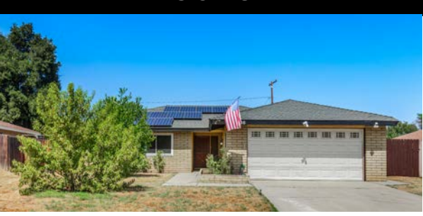
27205 AURORA DR, HEMET 4 BED / 1.75BATH / 1,928 SQ. FT LISTING PRICE: $479,900

Welcome to this charming single-story home in Hemet, Offering 4 spacious bedrooms and 1.75 baths. The kitchen is a chef's delight, featuring newer white appliances, updated cabinetry, and stunning granite countertops, all flowing seamlessly into the inviting great room. Cozy up by one of the two brick fireplaces. The home boasts modern touches, including dual-pane windows, ceiling fans throughout, and skip trowel walls and