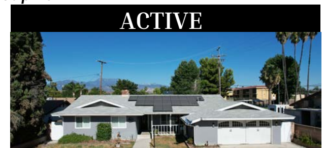
200 Terry Ln, Hemet 3 bed / 1 + .75 bath / 2,026 AQ. FT LISTING PRICE: $434,900

Welcome to this adorable 3-bedroom, 2-bath home in the highly sought-after Wildomar community. This 1,272 sq. ft. corner lot home features new luxury vinyl plank flooring, a cook's kitchen with a new sink, a cozy fireplace, and a primary bedroom with mirrored wardrobe doors. The large 7,840 sq. ft. lot includes a shed, a 2-car garage, and mountain views. Enjoy low taxes, no HOA, and proximity to schools, parks, shopping, and freeways.