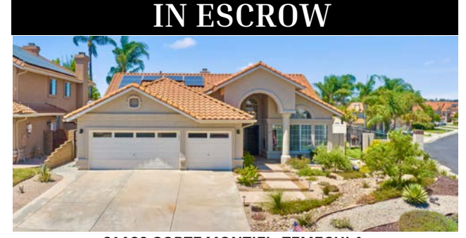
31468 CORTE MONTIEL, TEMECULA 4 BED / 2 BATH / 2,160 SQ. FT LISTING PRICE: $799,900

Great 4plex located in an ideal location in Ontario. Builder is Covington. Cul-de-sac location. Built in 1980. All units have long term tenants with month -to -month leases. All units are 2 stories with attached garages. Washer/dryer hookups in the garages. Seller pays water, insurance, and the gardener. Tenants pay their own gas and electricity. Air conditioning units are newer, seller states 2022 approximately. Each unit has a private gated area. Roof is shingle. Original owners. Close to schools, freeways, medical, and the Ontario Airport.