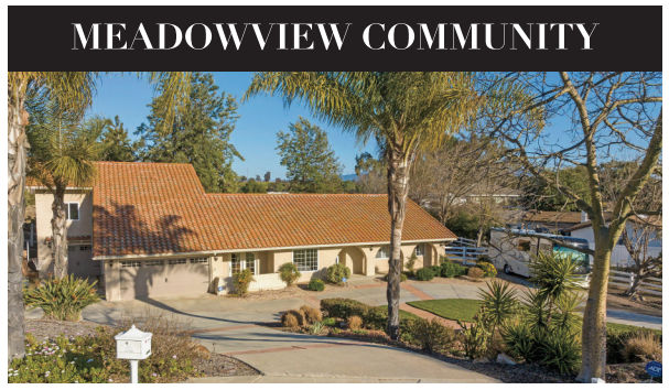
41498 AVENIDA BARCA, TEMECUA 6 BED / 2.75 BATH / 2,766 SQ.FT. LISTING PRICE: $998,000

Incredibly welcoming home. Great room has upgraded custom mantle/fireplace. Crown molding, trimmed windows and wainscoting at stairs and in master bed/bath. Cool tile flooring throughout downstairs high traffic areas. Beautiful champagne carpet. 3 car garage. Gorgeous remodeled kitchen with stainless steel appliances, granite countertops, white cabinetry, nickel pulls, center island. 7 ceiling fans throughout. Backyard has patio cover and shaded seating area. Above ground spa, built-in BBQ island with sink, two burner range. Custom pond with serene, rock waterfall. 22 solar panels on a power purchase agreement. Low taxes. No HOA.