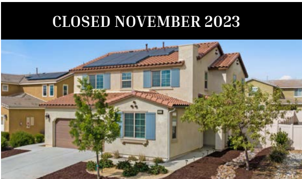
CLOSED NOVEMBER 2023 1312 BIG DIPPER DRIVE, BEAUMONT 4 BED / 3 BATH 2,067 SQ.FT CLOSED AT: $540,000 SOLD FOR: $15,000 OVER ASKING