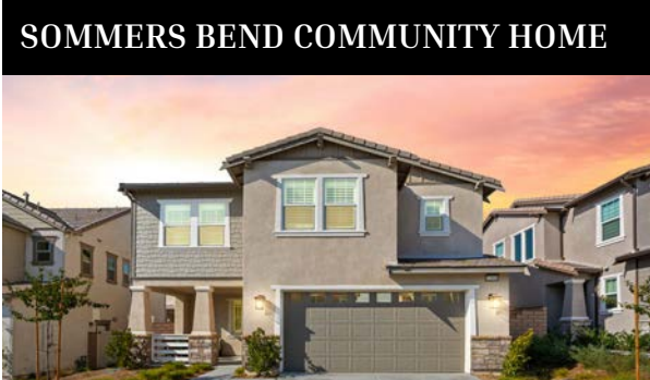
SOMMERS BEND COMMUNITY HOME 32006 RADIANT DR., TEMECULA 3 BED / 2.25 BATH / 2,180 SQ.FT / LOFT AREA LISTING PRICE: $799,900

Beautiful 2-story home in Temecula's "Sommers Bend." 2.5 years new, 3 beds, 2.5 baths. Features include a veranda porch, neutral tones, vinyl flooring, tankless water heater, custom shutters, and quartz kitchen countertops. Master bath with shower and tub. Landscaped backyard with covered California room. Community amenities: clubhouse, fitness center, resort-style pool, lap pool, BBQ area, firepits, and sports park. Close to shopping, schools, medical facilities, and wineries. Includes 13 paid-for solar panels.