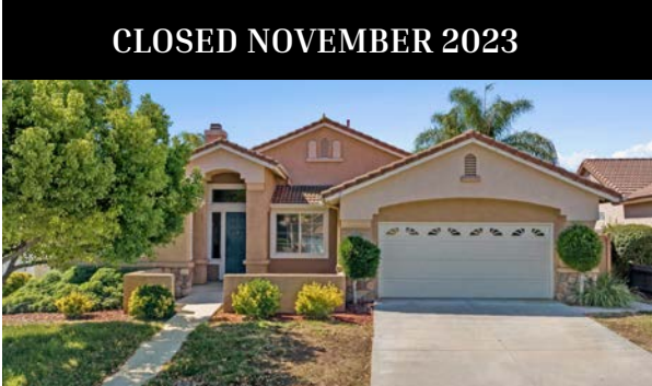
CLOSED NOVEMBER 2023 24117 VERDUN LN. MURRIETA 3 BED / 2 BATH / 2,030 SQ.FT PLUS 4TH ROOM/DEN CLOSED AT: $640,000

Desirable two-story Solera condo in Murrieta's sought-after community. This 1,466 sq ft home offers 3 bedrooms, 2 baths, and a downstairs powder room. Built in 2021, it features a well-maintained interior, luxury vinyl flooring, central air, and stylish kitchen with stainless steel appliances. The property includes a two-car garage, leased solar with Sunnova, and access to community amenities like pool, spa, and park. Conveniently located near schools, shopping, and freeway access.