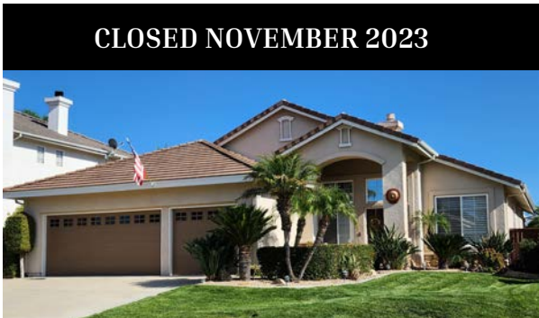
CLOSED NOVEMBER 2023 39647 VIA GALLETAS, MURRIETA 4 BED / 2.5 BATH 2,238 SQ.FT CLOSED AT: $705,000

Embrace luxury in this Sundance Beaumont home featuring elegant vinyl plank flooring and a masterful kitchen with granite countertops and top-tier appliances. The grand living room, perfect for entertainment, boasts surround sound and recessed lighting. The serene master suite offers stunning mountain views and smart lighting. With eco-friendly features like solar panels, this home in a sought-after community promises a remarkable living experience.