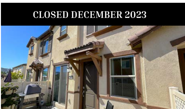
CLOSED DECEMBER 2023 41976 RONDO ST # 2605, MURRIETA 3 BED / 2.5 BATH / 1,466 SQ.FT CLOSED AT: $495,000

This single-story gem high-end finishes throughout. The open and airy ambiance is enhanced by 9-foot ceilings, luxury vinyl plank flooring, and recessed lighting. The chef's dream kitchen boasts custom back-splash, stainless steel appliances, and a large island. The master suite is a tranquil retreat with a spacious walk-in closet and an impressive bathroom. Smart home capabilities and a Quiet Cool house fan add modern convenience. The backyard oasis includes a covered Arizona room and lush landscaping. Leased solar panels, a tankless water heater, and a water filtration system contribute to energy efficiency. This home offers access to amenities situated near schools, shopping, and major freeway