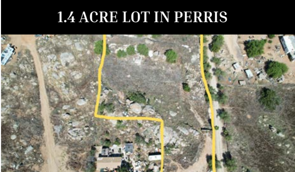
1.4 ACRE LOT IN PERRIS 0 SAWGO DR, PERRIS APN: 322090018 / 322090019 60,984 SQ.FT LISTING PRICE: $150,000

Beautiful 2-story home in Temecula's "Sommers Bend." 2.5 years new, 3 beds, 2.5 baths. Features include a veranda porch, neutral tones, vinyl flooring, tankless water heater, custom shutters, and quartz kitchen countertops. Master bath with shower and tub. Landscaped backyard with covered California room. Community amenities: clubhouse, fitness center, resort-style pool, lap pool, BBQ area, firepits, and sports park. Close to shopping, schools, medical facilities, and wineries. Includes 13 paid-for solar panels.