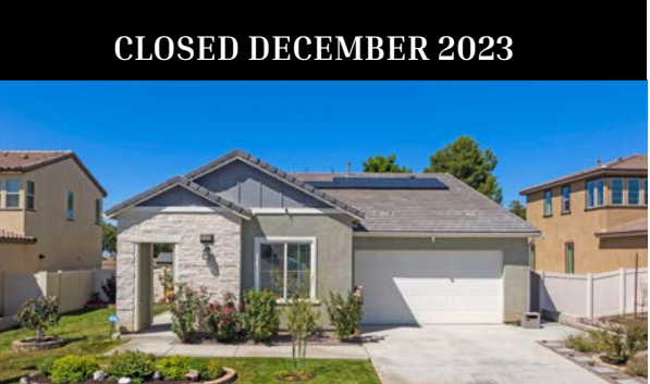
CLOSED DECEMBER 2023 1565 MILKY WAY, BEAUMONT 4 BED / 2 BATH / 1,971 SQ.FT CLOSED AT: $530,000

Remodeled kitchen with stainless steel appliances and luxury vinyl plank flooring. Three bedrooms feature new carpet and elegantly remodeled bathrooms. The great room boasts a vaulted ceiling and a cozy fireplace. A formal dining room and family room provide ample space for entertaining. The master bedroom features a vaulted ceiling, and sculpted concrete and a gazebo. Upgrades include fixtures, mirrored wardrobe doors, newer windows, A/C unit, and furnace. With fresh paint, beautifully upgraded tile in bathrooms, and a two-car garage, this home is a true gem!