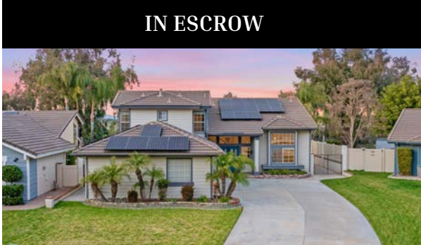
IN ESCROW 31280 CORTE ALHAMBRA., TEMECULA 4 BED / 2.75 BATH / 2,050 SQ.FT LISTING PRICE: $749,900

Two Residential Raw Land Parcels For Sale Sold Together. Accessible From Two Streets. First Parcel Under The APN Number 322-090-018 Is 36,590 Square Feet (0.84 Acres). Second Parcel Under The APN Number 322-090-019 Is 24,393 Square Feet (0.56 Acres).