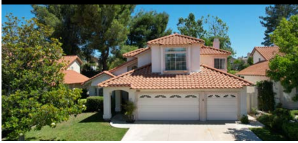
32106 VIA SALTIO, TEMECULA 4 BED / 2.75 BATH / 2,693 SQ. FT LISTING PRICE: $759,900 CLOSED AT: $764,900