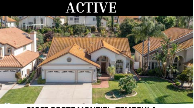
31367 CORTE MONTIEL, TEMECULA 4 BED / 2 BATH / 2,160 SQ. FT LISTING PRICE: $779,000

Beautiful views describe this stunning single-story custom built ranch estate residence. Located in the serene outskirts of West Hemet. This gorgeous estate also boasts 6.06 beautiful acres. Approximately 2 acres of land is fenced. Almost completely remodeled. Enter through your own private electric wrought iron gates. Enter through a double door entry. Primary bathroom with jetted tub and custom shower. His and her closet with built-ins and double French doors to the breezeway. 27 paid for solar panels. 2 Tesla batteries. Above ground spa. RV access with multiple cleanouts, and / or ADU's.