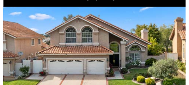
31628 PASEO GOLETA, TEMECULA 5 BED / 3 BATH / 3,087 SQ.FT LISTING PRICE: $865,000

Gorgeous two-story home in the "Rancho Vista Estates" Community, Temecula. Featuring 3,087 sq. ft., 5 bedrooms, and 3 baths (1 bed/bath downstairs). Enjoy sunset views from the primary bedroom balcony with 2 walk-in closets and a luxurious bathroom. Highlights include hardwood and tile flooring, ceiling fans, 2 fireplaces, crown molding, recessed lighting, a wet bar, a custom kitchen, indoor laundry, and a 3-car garage. Large backyard with pergola, stream, and waterfall. Close to parks, schools, shopping, and wineries.