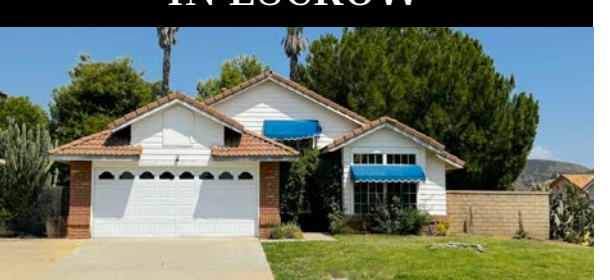
33742 VIEW CREST DR, WILDOMAR 3 BED / 2 BATH / 1,272 SQ. FT LISTING PRICE: $525,000

Welcome to this adorable 3-bedroom, 2-bath home in the highly sought-after Wildomar community. This 1,272 sq. ft. corner lot home features new luxury vinyl plank flooring, a cook's kitchen with a new sink, a cozy fireplace, and a primary bedroom with mirrored wardrobe doors. The large 7,840 sq. ft. lot includes a shed, a 2-car garage, and mountain views. Enjoy low taxes, no HOA, and proximity to schools, parks, shopping, and freeways.