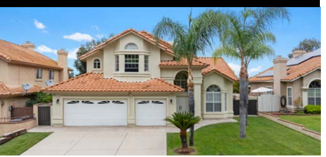
31606 PASEO GOLETA, TEMECULA 4 BED / 2.75 BATH / 2,622 SQ.FT LISTING PRICE $879,500