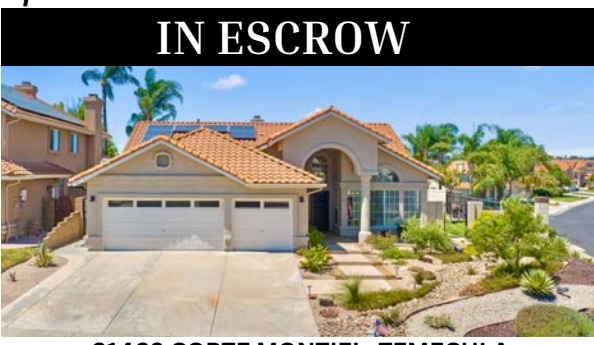
31468 CORTE MONTIEL, TEMECULA 4 BED / 2 BATH / 2,160 SQ. FT LISTING PRICE: $799,900

Beautiful single-story ranch-style home in the "Rancho Vista Estates" Community on a cul-de-sac. Offering 2,160 sq ft, 4 bedrooms, and 2 baths. The primary bedroom features a walk-in closet, double sinks, separate tub, and shower. High ceilings, natural light, travertine tile floors, granite countertops, and a central island. Includes a family room with a gas fireplace, indoor laundry, wet bar, and a three-car garage. Professionally landscaped yard with patio cover. Close to schools, shopping, and wineries.