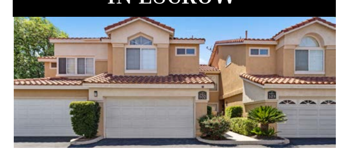
1101 PORTOFINO CT, #102, CORONA 3 BED / 2.25 BATH / 1,385 SQ. FT LISTING PRICE: $515,000

Welcome home! Sought after master planned community "Cortina" in Corona. Courtyard entry. Two-story, spacious 1,385 sq. ft. with 3 bedrooms (1 bedroom has doors and windows – no closet). 2 full baths and a powder room downstairs. High vaulted ceilings. Central heat and air. Cozy fireplace. Cool tile. Linoleum and carpet. Window coverings. Some shutters. Primary has a mirrored wardrobe door. Adorable kitchen with sitting area for dining. Fridge to remain, freezer in garage to remain as well as washer and dryer. Welcoming backyard with vinyl fencing. 2 car garage.