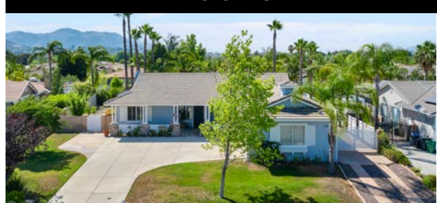
42332 CHISOLM TRL., MURRIETA 5 BED / 1+.75 +.50 BATH / 3,084 SQ. FT LISTING PRICE: $1,299,000

Welcome to your dream home in the highly sought-after Murrieta Ranchos Community! Sprawling across 3,084 sq. ft. of luxurious living space on a 0.38 acre lot . This home offers an abundance of flat, usable land with RV access. Enjoy the serene and private backyard paradise featuring a gorgeous grotto pool with a waterfall, a built-in fire pit, a gazebo, and a covered patio with recessed lighting. Step inside to discover elegant 10-foot coffered ceilings, crown molding, and custom blinds and shutters throughout. No Association!