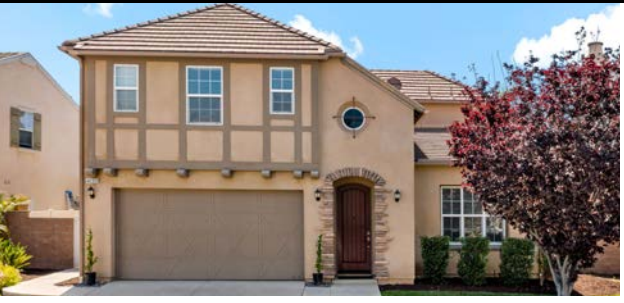
46319 LONE PINE DR, TEMECULA 4 BED / 3 BATH / 2,882 SQ. FT LISTING PRICE: $849,900