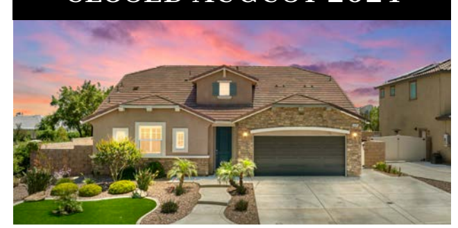
26345 ADELINA DR, MENIFEE 4 BED / 3 BATH / 2,481 SQ.FT LISTING PRICE: $719,900