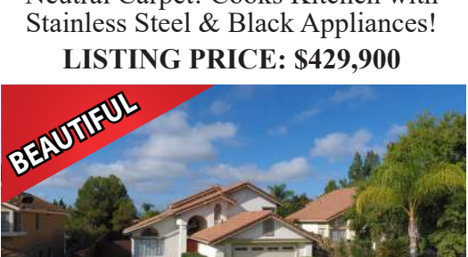
24595 Jacarte Dr., Murrieta

Rich Wood Flooring, Classy Tile, Neutral Carpet! Cooks Kitchen with Stainless Steel & Black Appliances!