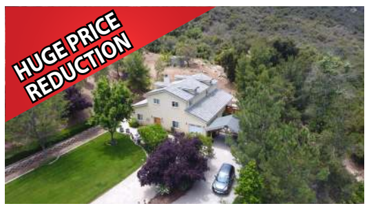
41225 Hacienda Dr., Murrieta

Beautiful Picturesque Custom Home! 2256 SqFt 4 Bed/2 Bath Located in La Cresta Highlands With approx.. 5 acres of stunning Land with 200+ trees!