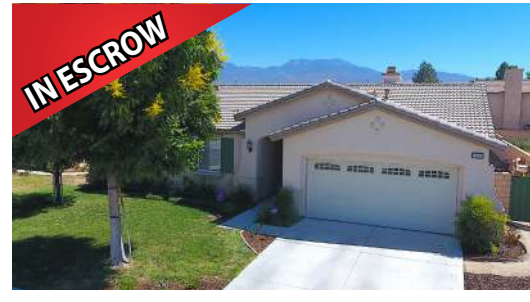
25886 Mercy Court., Hemet

Lovely One Story Home on Cul-De-Sac 1547 SqFt 3 Bed/2 Bath