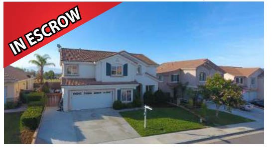
40773 Engelmann Oak Street., Murrieta